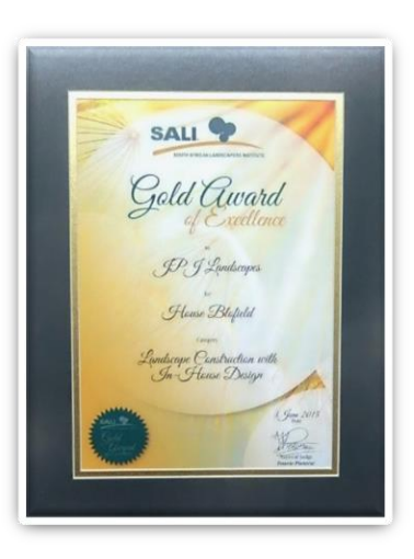
JPJLandscapes is registered with the Ethekwini Supplier Database as well as the Government Central Supplier Database

JPJ Landscapes is a principal member of SALI (South African Landscapers Institute)